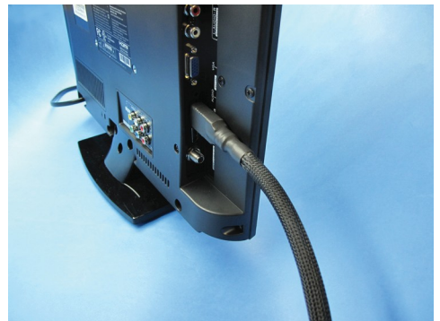
Fig 5: Attaching the Cable

5. Attach the HDMI cable to the TV or Video Screen.