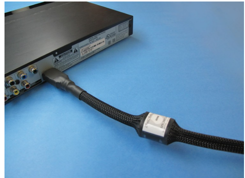
Fig 3: Attaching the Cable

4. Carefully align the output end of the HDMI cable to the TV or Video Screen.